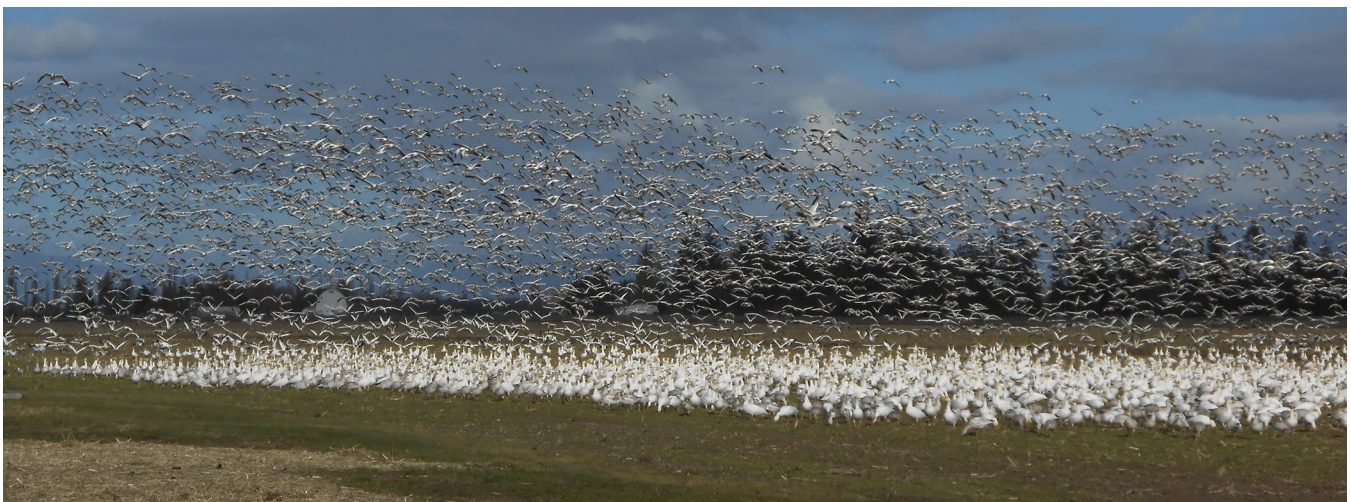
Snow geese near La Conner

Deb Nolan will be catering lunches Monday through Thursday. I will send you a form to fill out closer to the date of the retreat; fill it out and send it along with a check for $90 at least 30 days before the retreat (so, mail this by January 24th). If your form and payment are received less than 30 days before the event the cost goes up to $100.