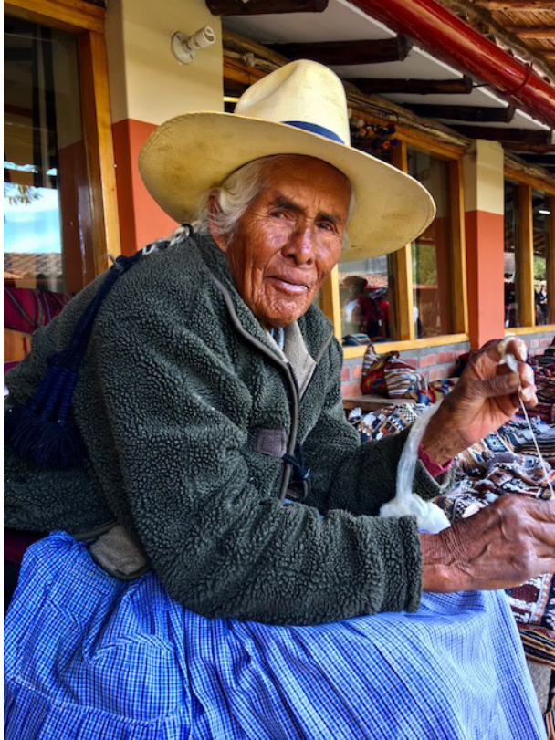
An expert artisan in Chinchero