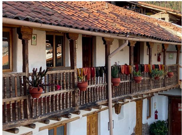
Our naturally dyed yarn drying at El Balcón

12 Nov: Depart for Ollantaytambo. Ollanta has been described as “perfect for wandering the mazy, narrow byways, past stone buildings and babbling irrigation channels, pretending you’ve stepped back in time.” Settle into El Albergue, our family-run hotel. Festive pachamanca lunch and a tour of the farm’s gardens, coffee roasting business, and distillery.