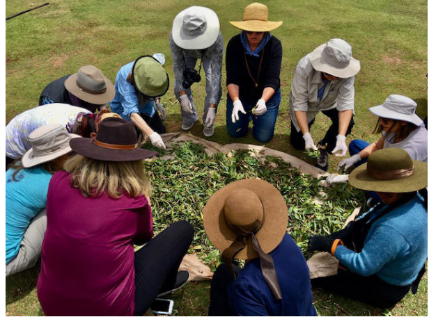
Natural dye class at CTTC

11 Nov: Travel to Chinchero for an all-day natural dyeing workshop with our friends at the amazing Centro de Textiles Tradicionales del Cusco/ Center for Traditional Textiles of Cusco. Traditional lunch included.