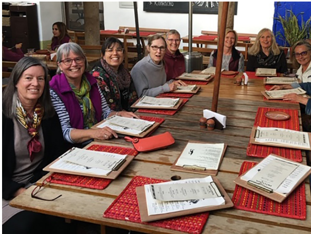
Dinner at Pachapapa

(subject to change as new possibilities present themselves!)