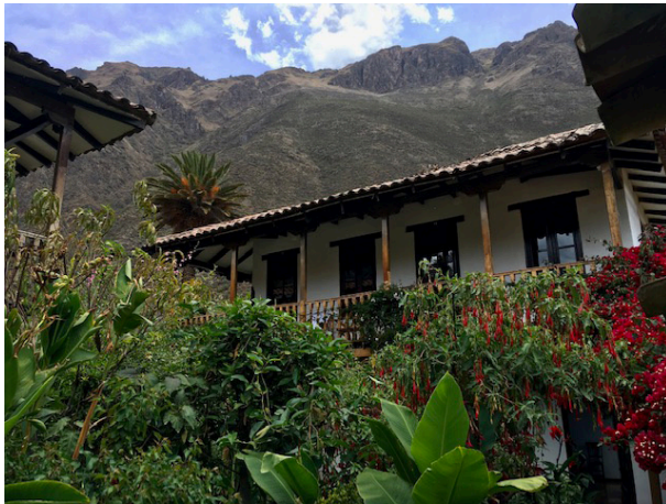
El Albergue in Ollantaytambo