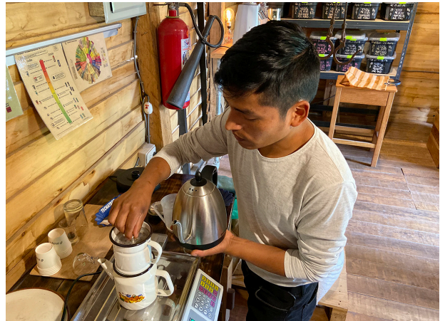
Coffee brewing lesson at El Albergue