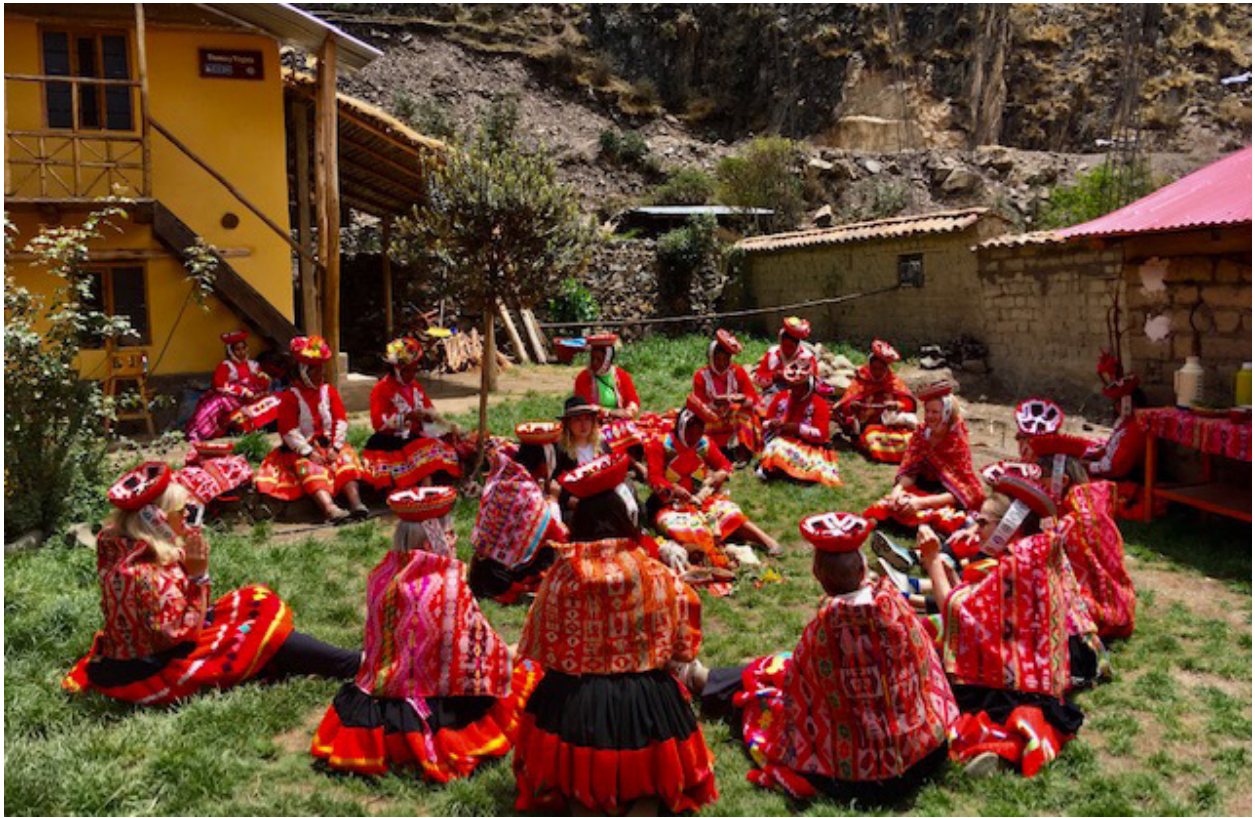
Visiting Huilloc Bajo