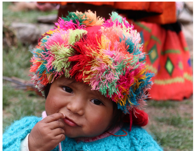
Young girl in Huilloc Bajo

Peru is one of the warmest and most intelligent textile cultures in the world. (This dates back, literally, 1000s of years.) As you read the tour itinerary you will notice our emphasis on knitting. The best way we can enter into a relationship with a culture that has such a deep